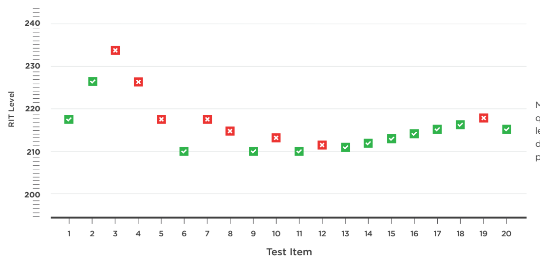
MAP Growth begins with a question at each student's grade level and adjusts the level of difficulty based on individual performance.

MAP Growth is a computer-adaptive test. If your child answers a question correctly, the next question is more challenging. If they answer incorrectly, the next one is easier. This type of assessment challenges top performers without overwhelming students whose skills are below grade level.